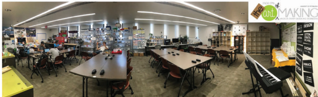
Figure 2. Photograph of the G34 Art of Making design studio in Benedum Hall.