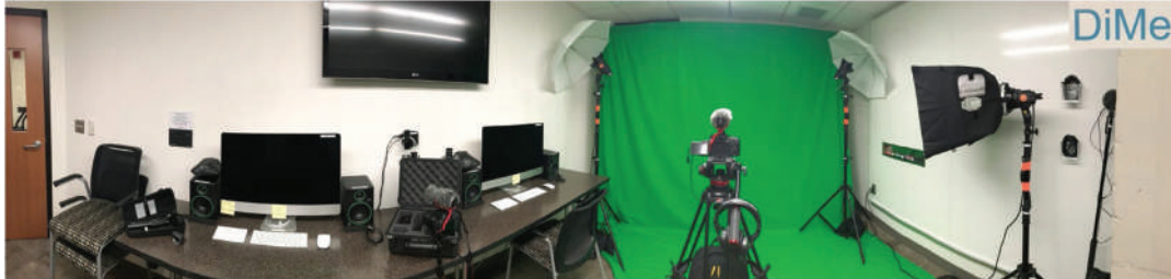
Figure 4. Photograph of the Digital Media Lab in Benedum Hall.

students can create, edit, and produce high-quality audio and video products, shown in Fig. 4. The Tier 3 space has been allocated and is scheduled to come online in the spring of 2019. More details of the spaces can be found at www.makers.pitt.edu .