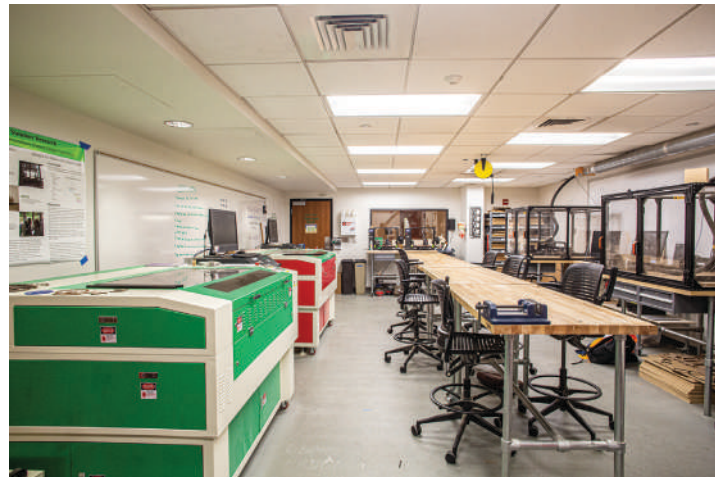
Figure 3. Photograph of the MS2 Makerspace in Benedum Hall.