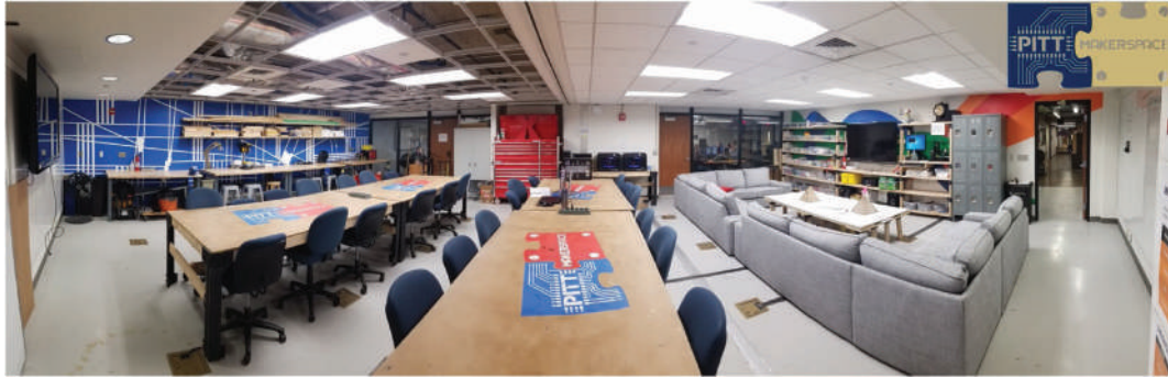
Figure 1. Photograph of the MS1 Makerspace in Benedum Hall.